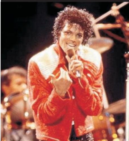
Without a doubt one of the most influential and successful artists in music history, Michael Jackson had 17 #1 hits, won 13 Grammys, and sold hundreds of millions of albums. Fans around the world were shocked by news of his death on June 25, when the "King of Pop" stopped breathing and could not be resuscitated.