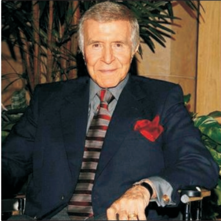
A film and television star whose career spanned seven decades, Ricardo Montalban was perhaps best known for his role as the mysterious Mr. Roarke on TV's "Fantasy Island" from 1977 to 1984. He died January 14 from congestive heart failure at the age of 88.

From Michael Jackson to Patrick Swayze, the entertainment world said goodbye to a number of icons this past year.