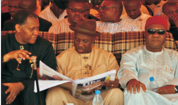
Governor Amaechi (centre) flanked by Chief Vincent Ogbulafor, National Chairman of PDP and Hon Odein Ajumogobia, Minister of State, Petroleum going through a copy of The Tide newspaper at the 70th Birthday celebration of Chief G. U. Ake, PDP chairman, Rivers State.